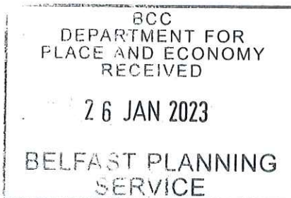
Victor Clegg Land Acquisition